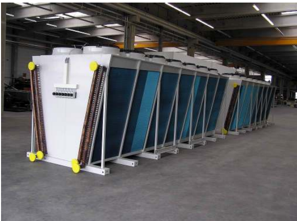
A V-block dry-cooler